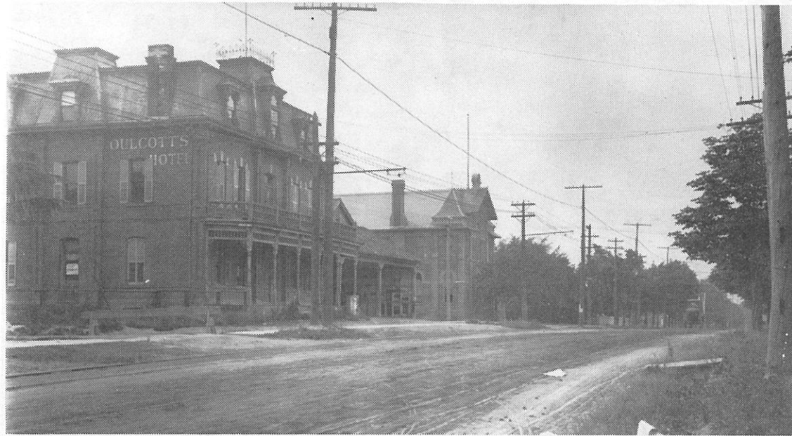
Looking north along Yonge Street. Oulcott's Hotel sits on the site of Montgomery's Tavern of 1837 Rebellion fame. Today, Postal Station K occupies the spot. Beyond is the Town Hall, with an attractive wooden stable between