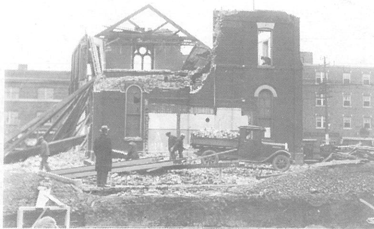
Demolition of the Town Hall to prepare for the new No. 12 Police Station.