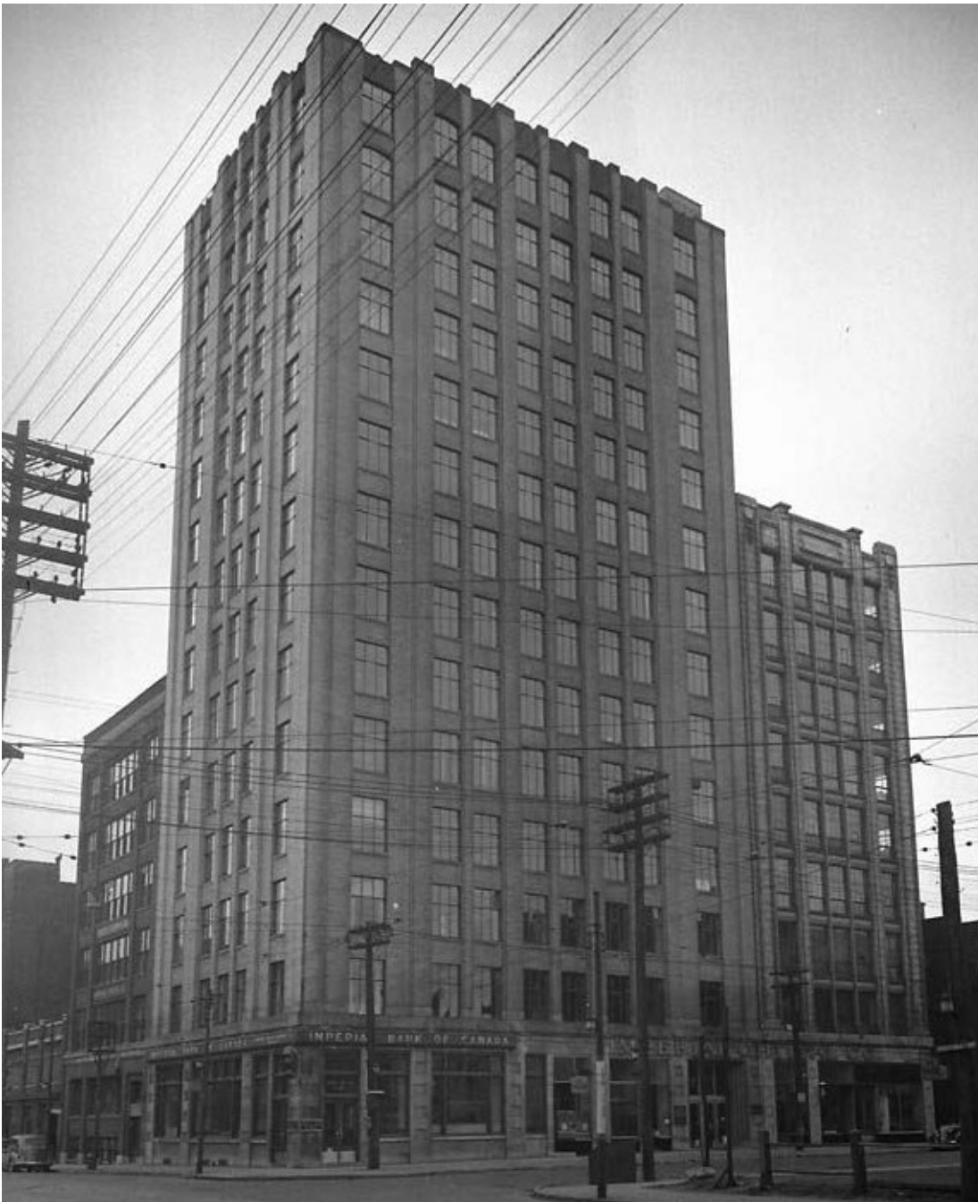
Hermant Building (1913), 19 Dundas Square (right) and Hermant Building (1929), 21 Dundas Square (left). The Hermant Annex (1920) is shown on the left.