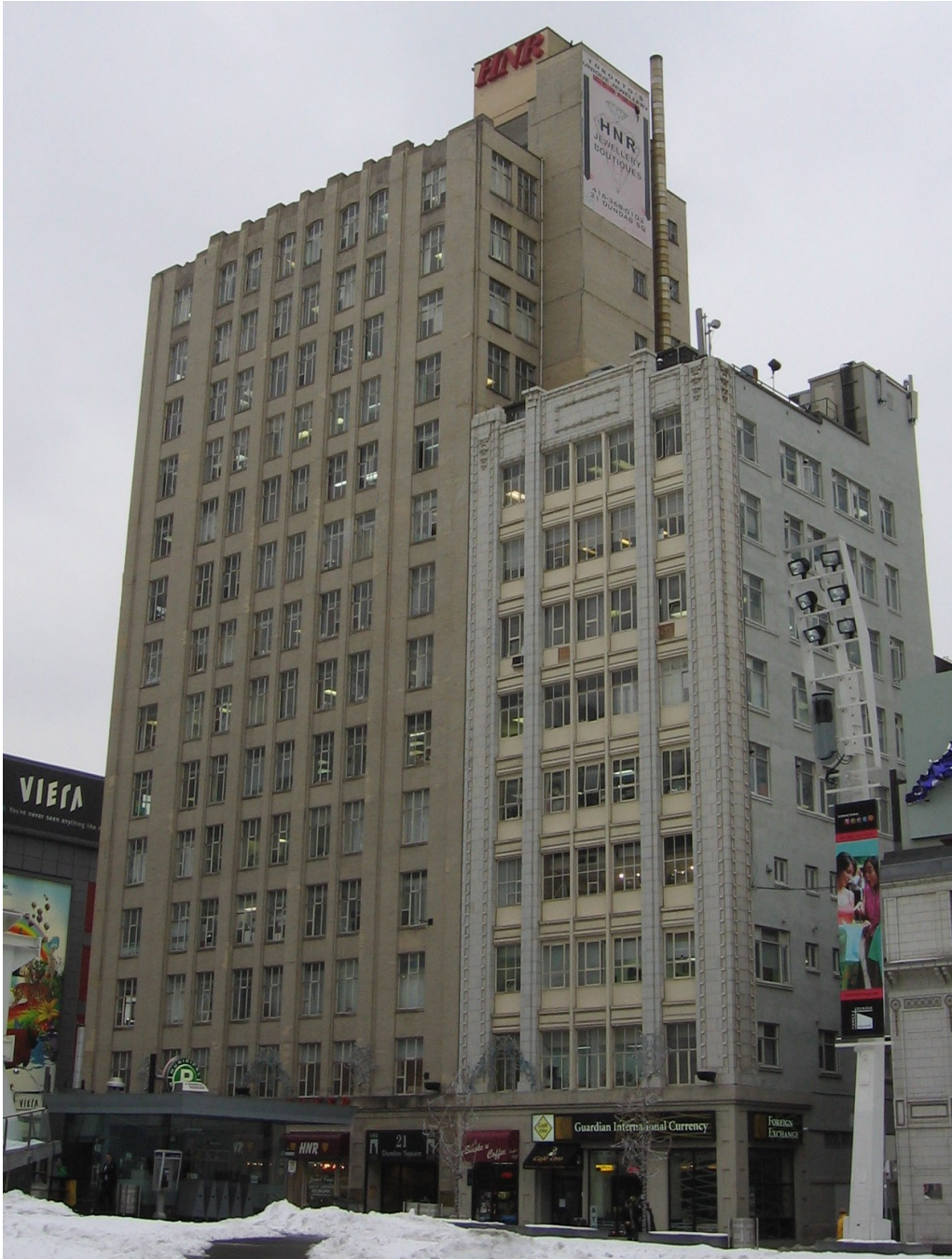
Hermant Building (1913), 19 Dundas Square (right) and Hermant Building (1929), 21 Dundas Square (left)