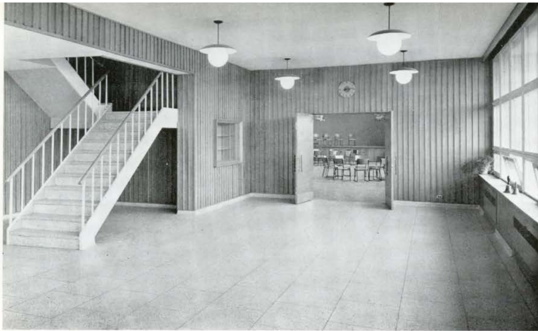
Foyer — walls, natural brick; stairwell, white; display case and clock, blue.