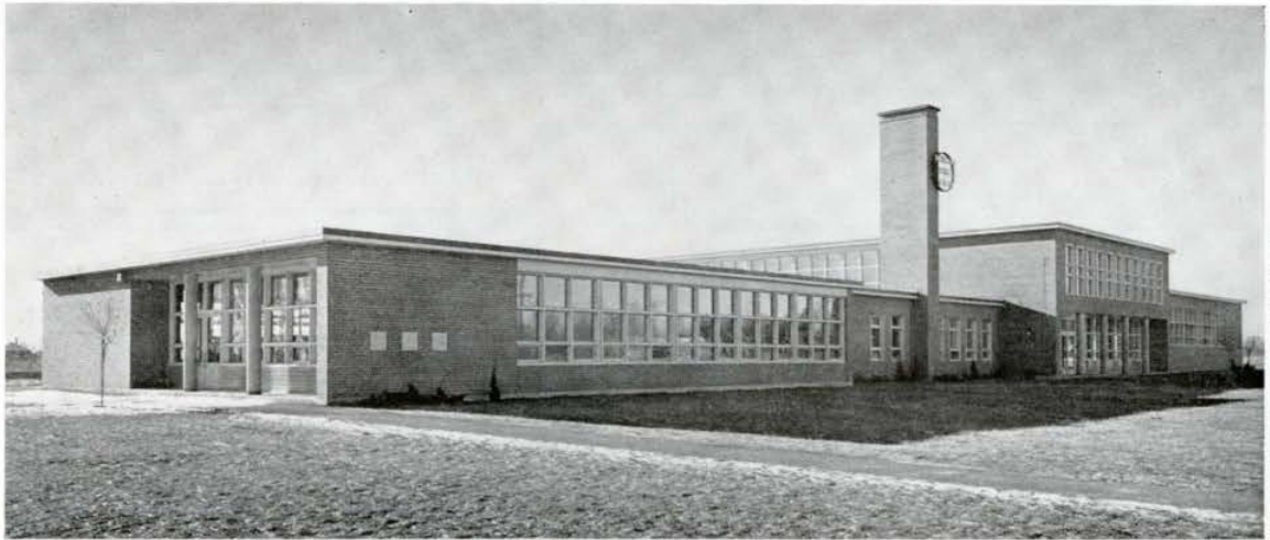
View before landscaping

General Contractors, Dalton Engineering & Construction Co. Ltd.