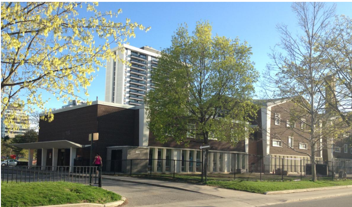
Top photograph showing the south elevation of the school facing the playground with the Day Nursery and Roof-top Playground on the left, the Junior School and shared services pavilion with chimney and the School for the Deaf with 1965-6 addition at the far right. (HPS, 2016) Bottom photograph showing the east and north elevations of the two-storey, 1965-6 addition (HPS, 2016)