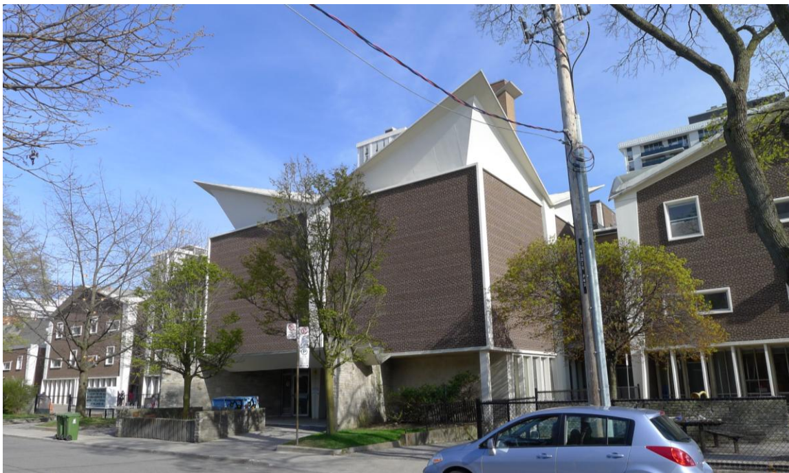
Photographs showing an aerial view of the school complex with the entry pavilion at the centre, two Toronto School for the Deaf pavilions to the left with the 1965-6 addition at the far left and the Davisville Junior Public School and Day Nursery on the right (top photo- Google Maps April, 2016 ) and the north elevation facing Millwood Road with the entry pavilion flanked by the junior school on the right and the Deaf School on the left (bottom photo - Heritage Preservation Services (HPS) 2016)