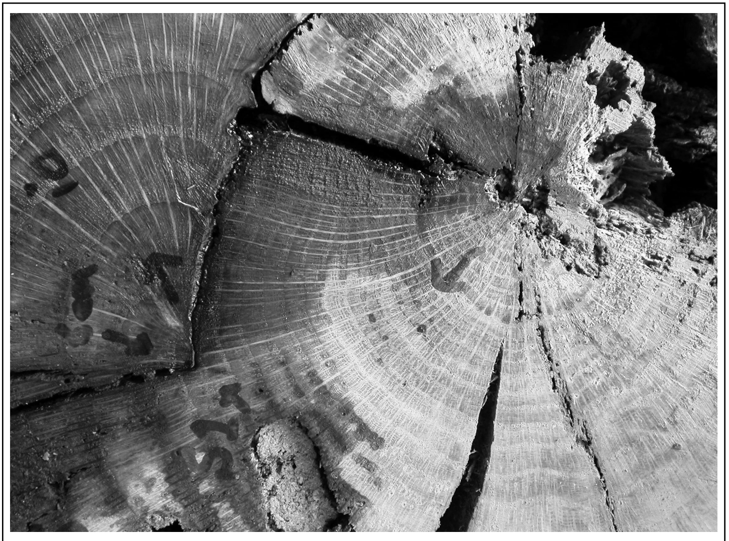
Figure 2. Example of fire scarring within a black oak cross-section (S7 in Figure 1), collected in 2009, High Park, Toronto. Subsequent ring growth exhibited sealing over the scar and an episode of increased ring width.

individuals in a burn. We therefore used the following corroborative fire event indicators: (1) the timing of establishment of multistemmed individuals (three of the 14 cross-sectioned individuals), which, among oaks, indicates basal resprouting in response to having been top-killed as a sapling, typically by fire or other disturbance (Keeley 1992; Del Tredici 2001), and (2) the presence of even-age cohorts in the pre-settlement period, which is suggestive of a fire-induced recruitment period (Abrams 1992; Peterson and Reich 2001). Our sample of cross-sections was also used to determine establishment dates ( n = 14 ). With respect to multistemmed individuals, resprouting following fire disturbance occurs simultaneously across all