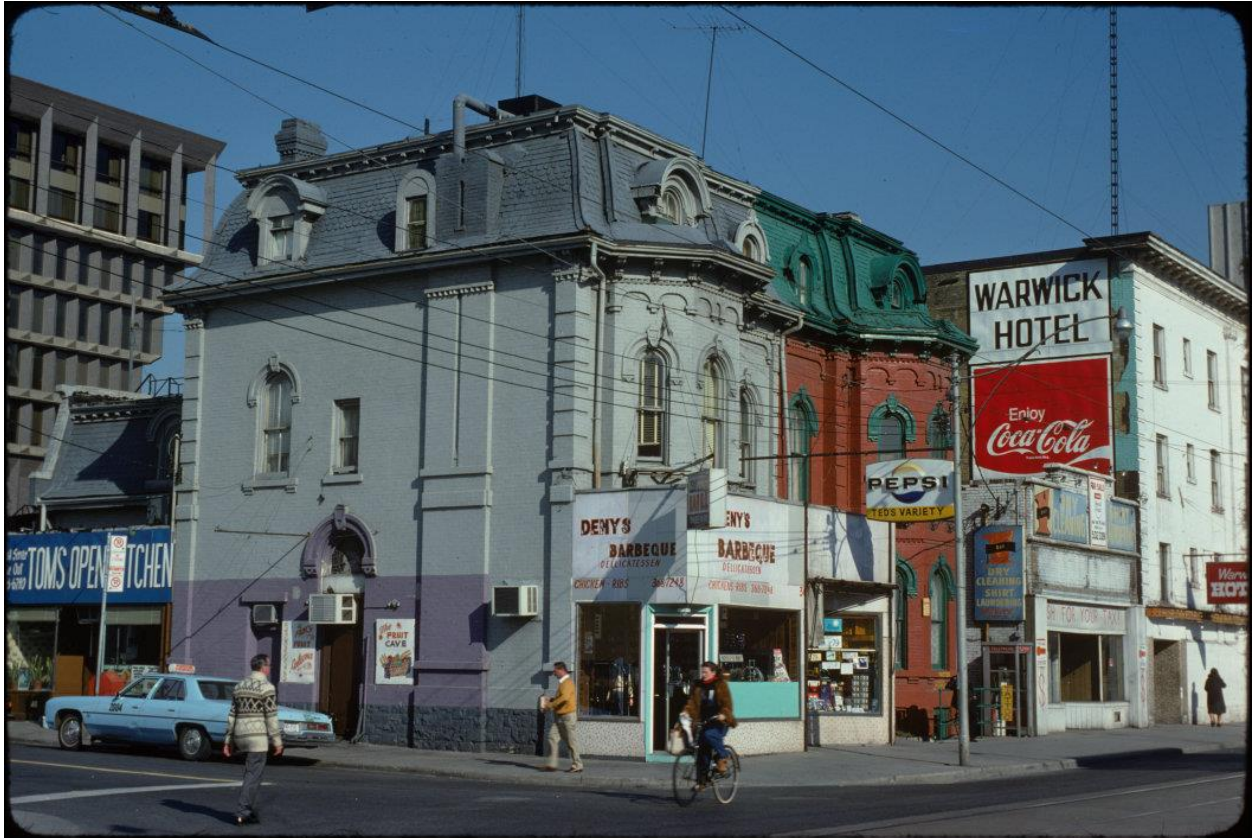
City of Toronto Archives, Fonds 1526, File 9, Item 12