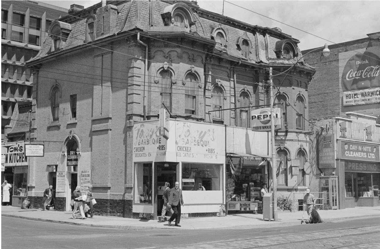
City of Toronto Archives, Fonds 2032, Series 841, File 69, Item 15